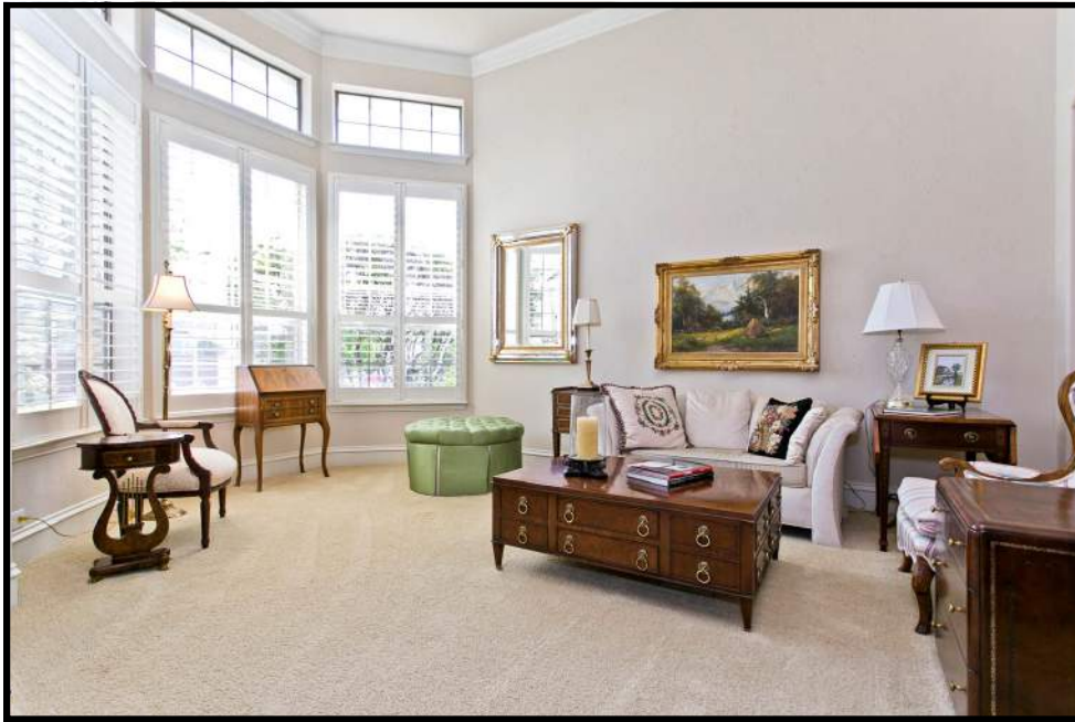
Formal Living with Crown Molding and 6" Baseboards. Transom Bay Windows with Plantation Shutters and Soaring Ceilings.