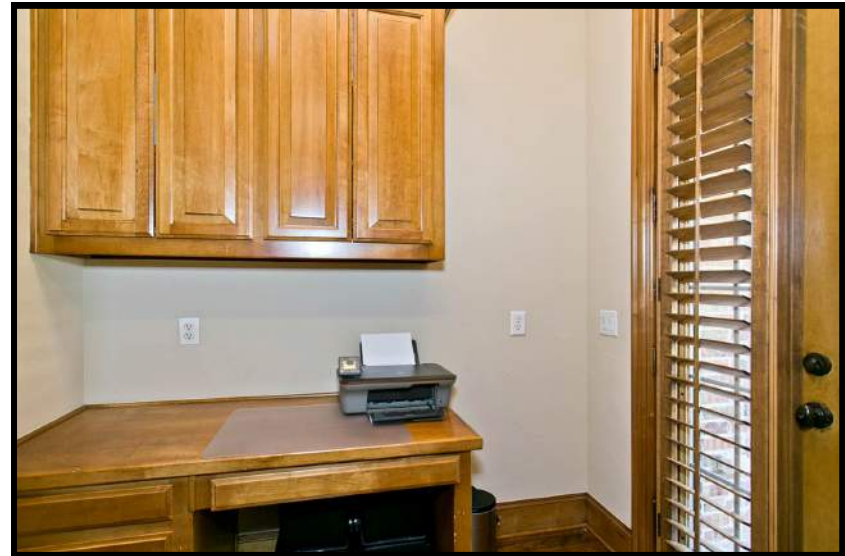
Administrative Suite within Study and Private Access to outside.