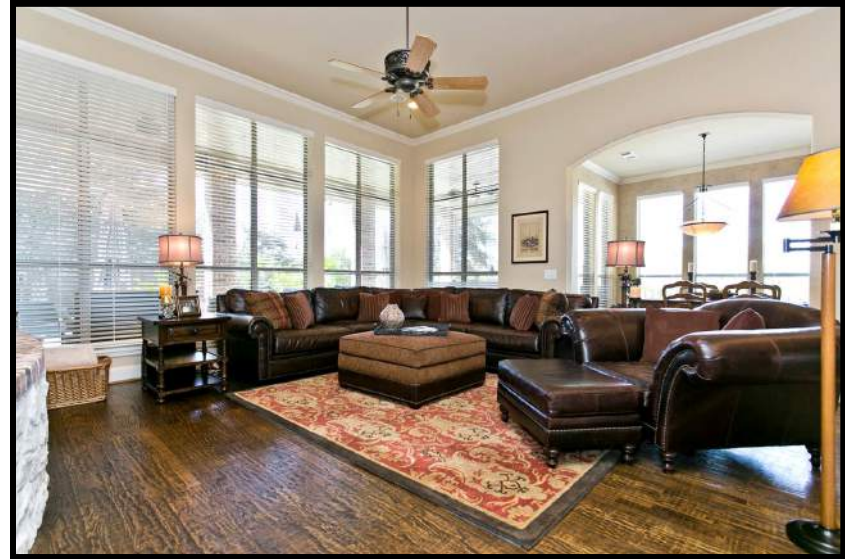
Family Room with Hand Scraped Hardwoods, Wall of Windows with Magnificent View of Pool Area