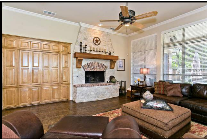
Family Room with Flagstone Fire Place, Cedar Mantle, Remote Gas Starter & Custom Entertainment Center