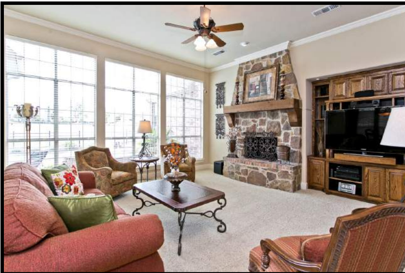
Family Room with Amazing Fire Place and Custom Entertainment Center