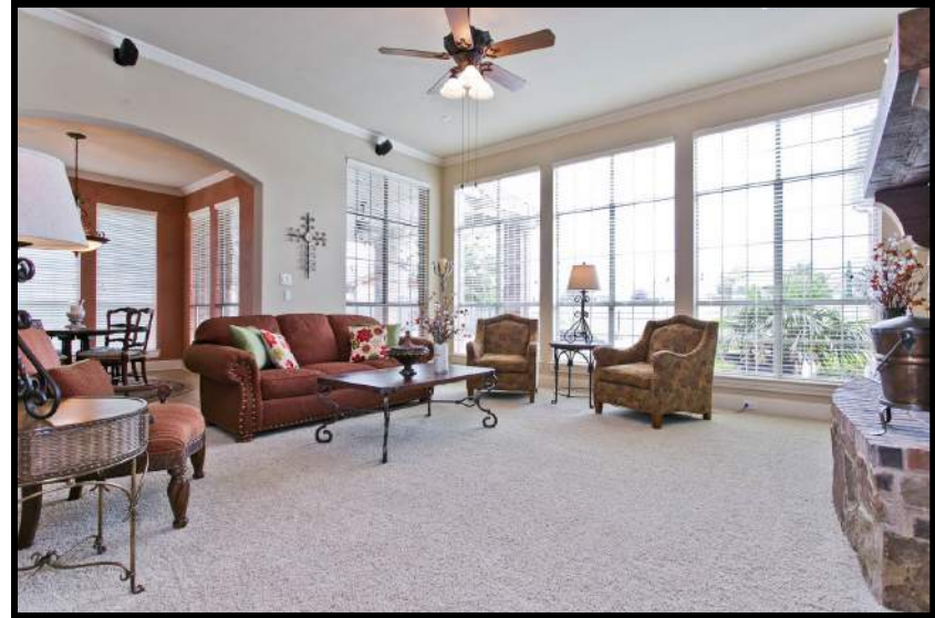
Open Family Room with Magnificent View of Golf Course, Pool & Spa