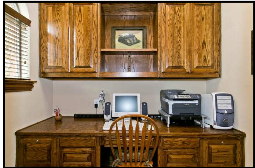
Admin Suite within Study