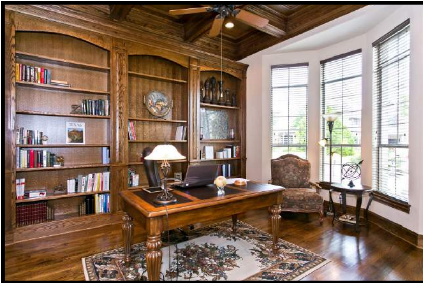
Study with Coffered Ceiling & Built-ins