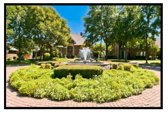
Plano ISD: Elementary School: Daffron Middle School: Robinson High School: Jasper Senior High: Plano West