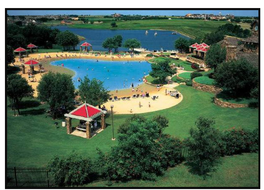
Stonebridge Ranch Beach Club